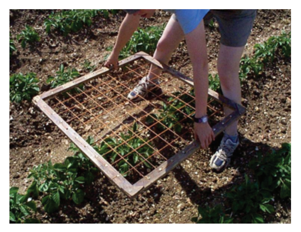
Figure 1. Use of a ground cover grid. Note: in this example the planting configuration is of single rows.

Place grid over a representative area of plants in field. Keep grid level with top of plants (i.e. do not squash plants so that leaf area distorts). The left-hand edge of the grid (A) should be aligned directly over the wheel furrow, with the right-hand edge (B) immediately over the central furrow of the bed (or centre row if using 3-row beds) (Figure 1).